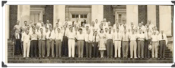
1947 AWPCA Conference attendees